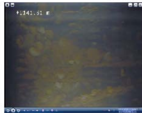
スクリーン破損により砂利が露出 As a result of a screen breakage, pebbles are exposed.