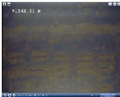
水アカ・スケールが付着 Water stains and scale