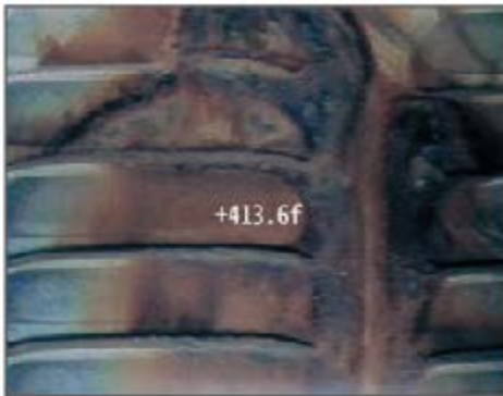
サイドビュー Side View