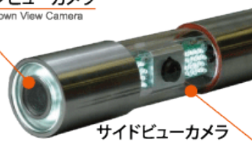
サイドビューカメラ Side View Camera