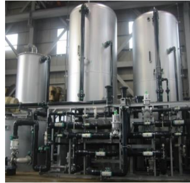
2-bed 3-tower type water purification equipment