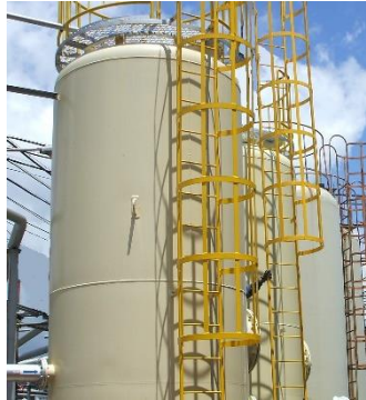
Multifunctional filtration equipment All-in-one filters