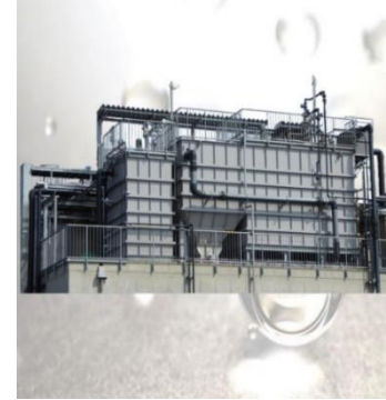
High-speed coagulative precipitation equipment