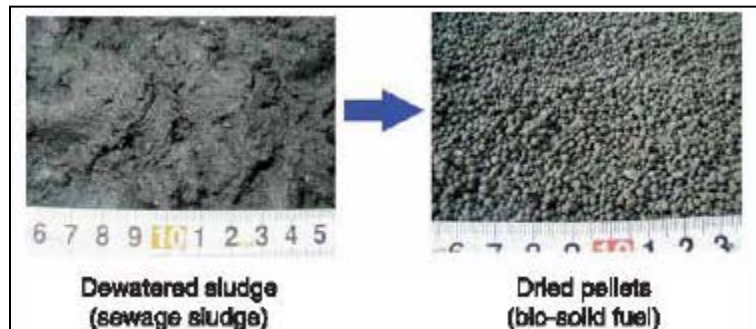
Fig.1 Appearance of Dewatered Sludge and Dried Pellets

The Hitz Pearl System adopts an indirect heating process that uses oil as a thermal medium and produces dried pellets (with a diameter from 1 to 10 mm), which has a water content not exceeding 10%, from sewage sludge without losing the calorific value of the sewage sludge. These dried pellets can change into easy-to-handle bio-solid fuel (see fig. 1).