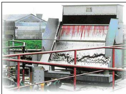
Application for dyeing drainage