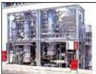
Stripper recycling system