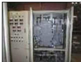
Developer recycling system