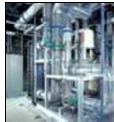
Ultra pure water circulation cooler