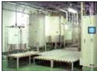
Developer dilution system