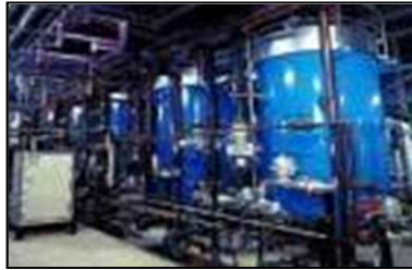
Ion exchange resin